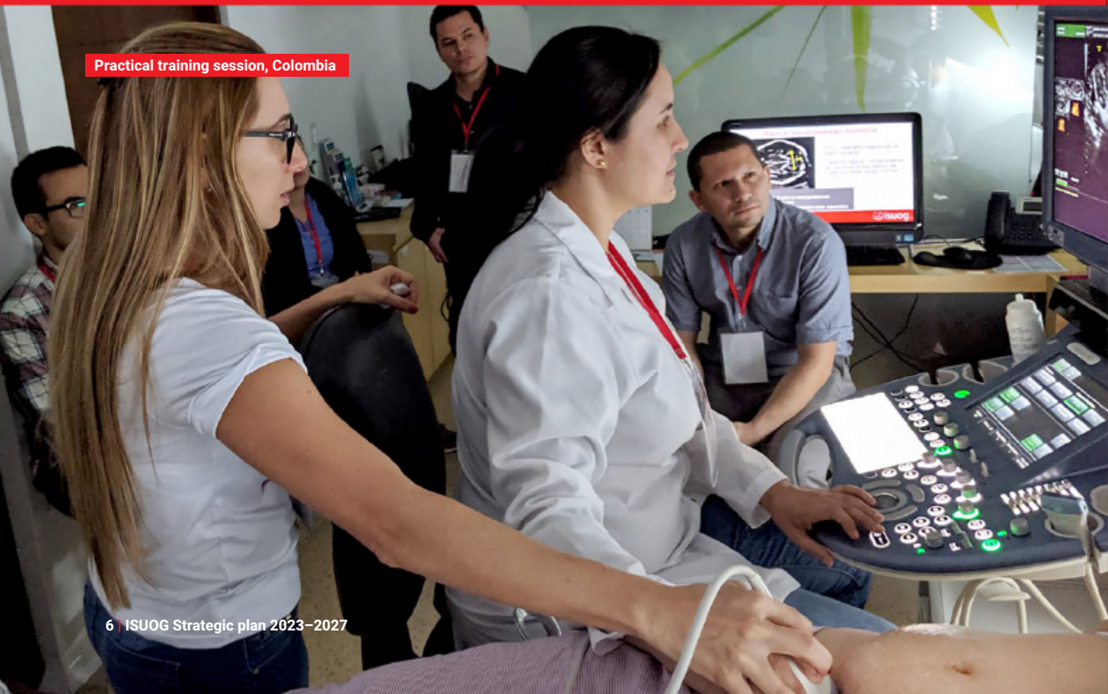
Practical training session, Colombia

Our mission is to improve women's health through the provision, advancement and dissemination of the highest quality education, standards, and research information around ultrasound in obstetrics and gynecology.