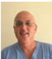
Dr. Gabriel Amir Schneider Children's Medical Center, Petah Tikva, Israel