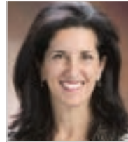
Dr. Meryl Cohen Children's Hospital of Philadelphia, Philadelphia, Pennsylvania, USA