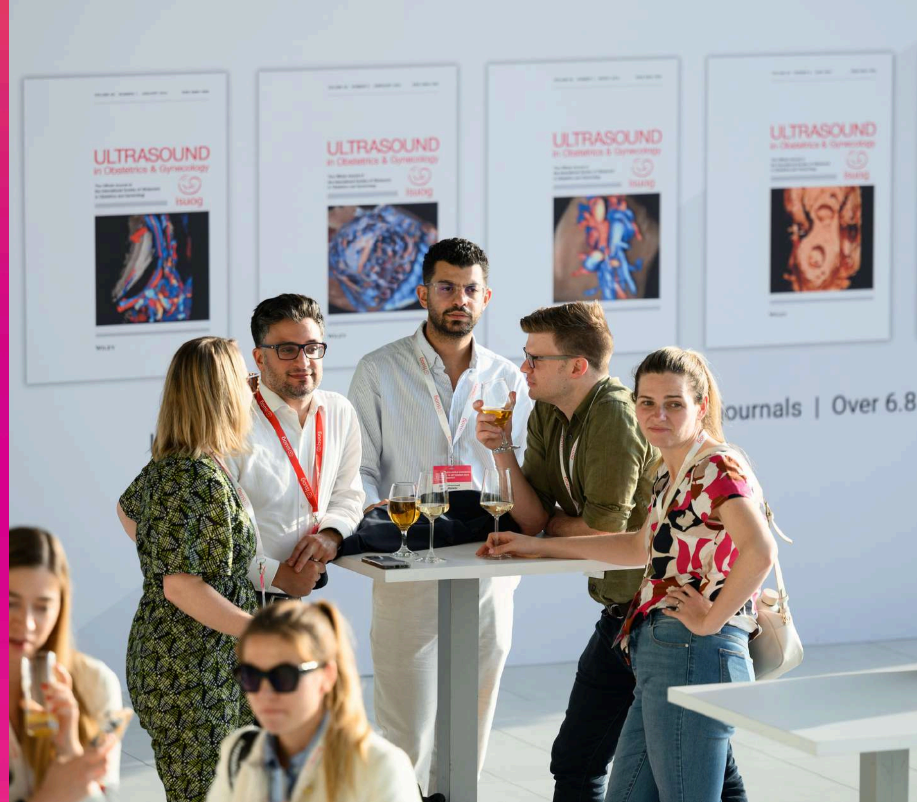
Delegates by profession