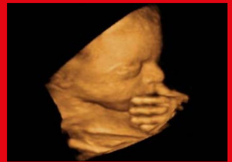
Figure 1. “italic” text may help to separate figures from the main text.

For many Congress participants, the ‘conclusions’ may be the most important element of a poster. You may feature this part with a larger type size – or give it a different colour.