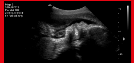
Figure 2. Choose only the best pictures and limit the number