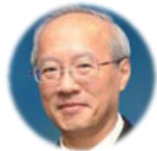
George SH Yeo (Singapore)